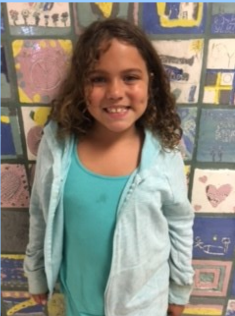
Eden "Principal of the Day" Tuesday, April 25th

They will be wearing name badges for easy identification.