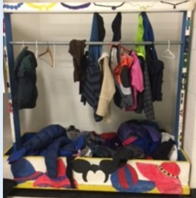
This week's items in search of their home.

Please label your child's belongings, including coats, lunch bags, backpacks, and other personal belongings for quick and easy identification. Items that are found are placed in the lost and found located on the first floor near the cafeteria. Smaller items, such as money, glasses, wallets, jewelry are kept in the Main Office. Unclaimed items are donated to a charitable organization at the end of the year.